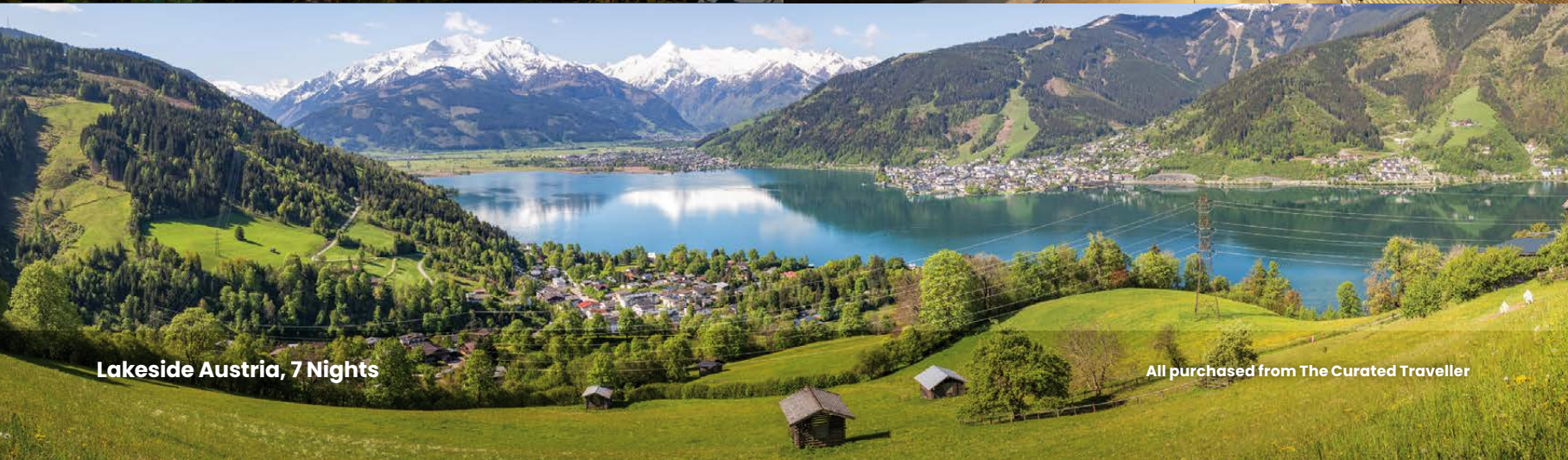
Lakeside Austria, 7 Nights

All purchased from The Curated Traveller