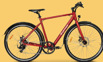
1 x Leitner Ultimate Step-Over eBike Purchased from Leitner Electric Bikes