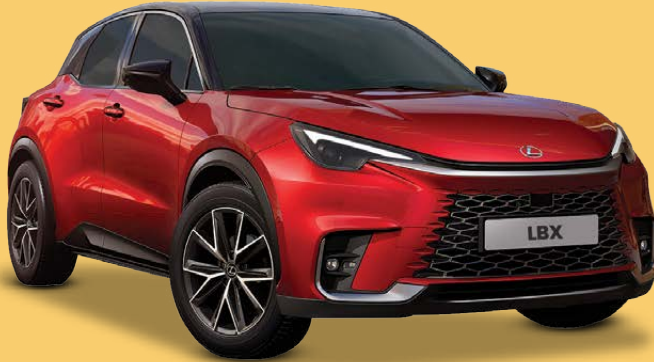
2025 Lexus LBX Hybrid