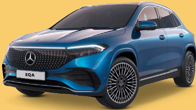
2025 Mercedes-Benz EQA 250+