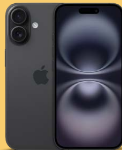
1 x Apple iPhone 16 Purchased from JB Hi-Fi