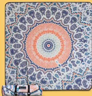
1,290 x Nakie Picnic Blanket Purchased from Nakie Co