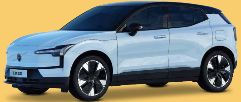
2025 Volvo EX30 Ultra Electric