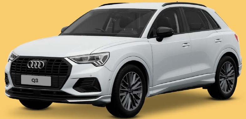
2025 Audi Q3