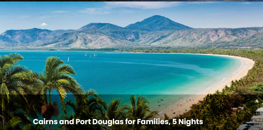
Cairns and Port Douglas for Families, 5 Nights