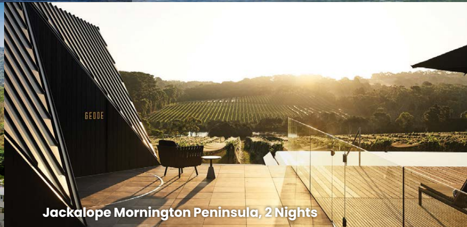
Jackalope Mornington Peninsula, 2 Nights