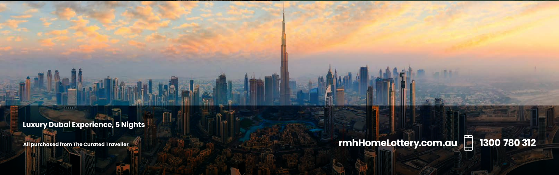
Luxury Dubai Experience, 5 Nights

All purchased from The Curated Traveller