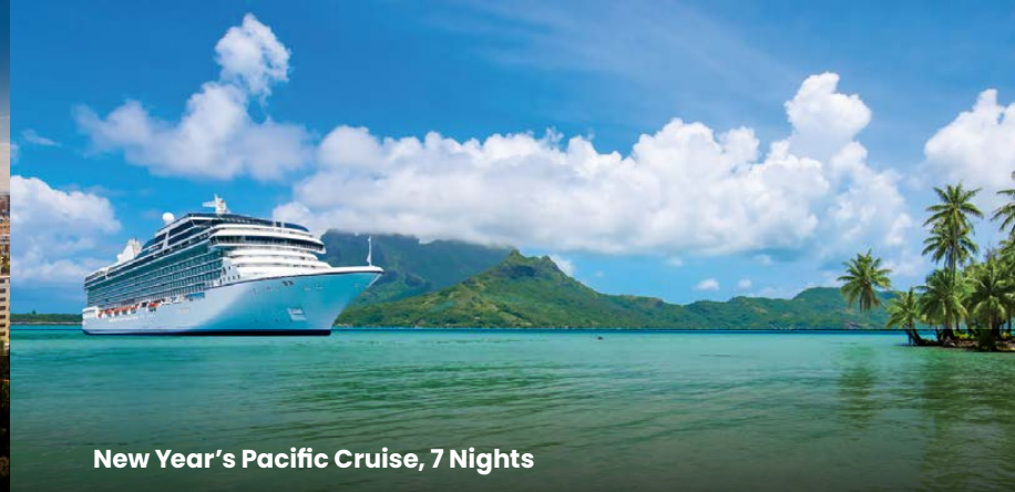
New Year's Pacific Cruise, 7 Nights