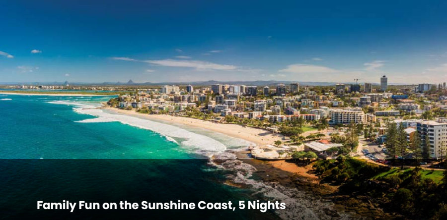
Family Fun on the Sunshine Coast, 5 Nights