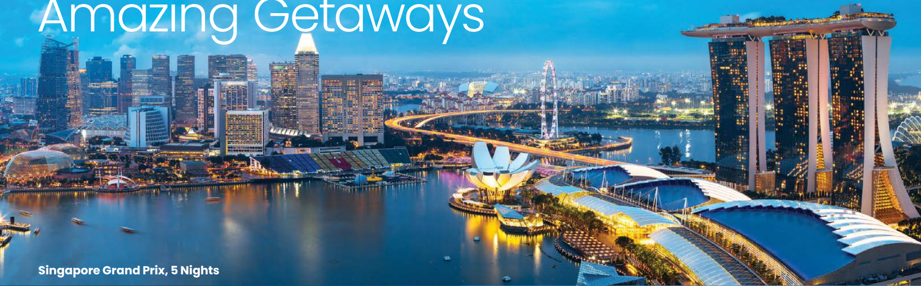
Singapore Grand Prix, 5 Nights