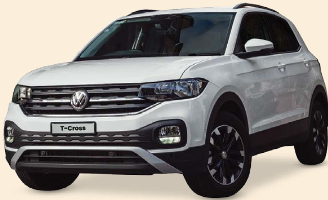
2024 Volkswagen T-Cross Purchased from Melbourne City Volkswagen