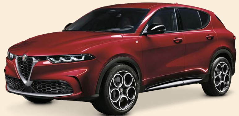
2024 Alfa Romeo Tonale Ti Hybrid Purchased from Zagame Automotive