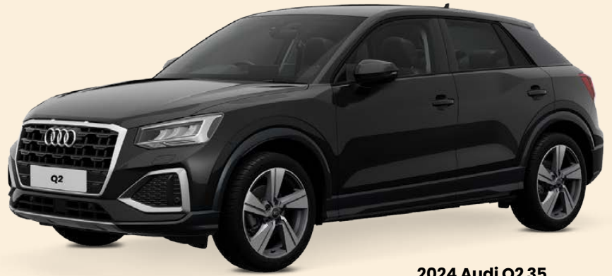
2024 Audi Q2 35 Purchased from Zagame Automotive