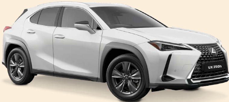
2024 Lexus UX 250h Hybrid Purchased from Lexus of Brighton